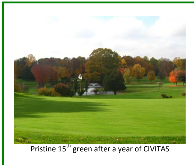
Pristine 15 th green after a year of CIVITAS

“This is a product that all Superintendents need to try!”