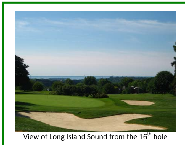
View of Long Island Sound from the 16 th hole

“Fungicide rates that should have given me 10-14 days of results lasted me 28-30 days! By stretching my spray program in this way, CIVITAS saved me a spray a month and helped save me money!”