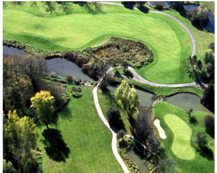
Aerial view of the 11 th hole at Stonebridge Golf Club.

“CIVITAS is an outstanding addition to the turf industry!”